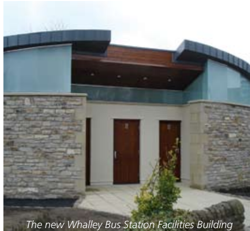
The new Whalley Bus Station Facilities Building